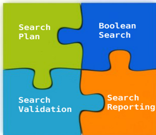
FIGURE 1: COMPONENTS OF AN SR SEARCH