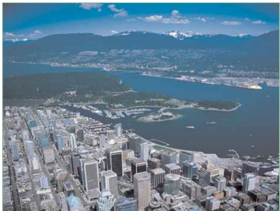
Aerial view of Vancouver, British Columbia.