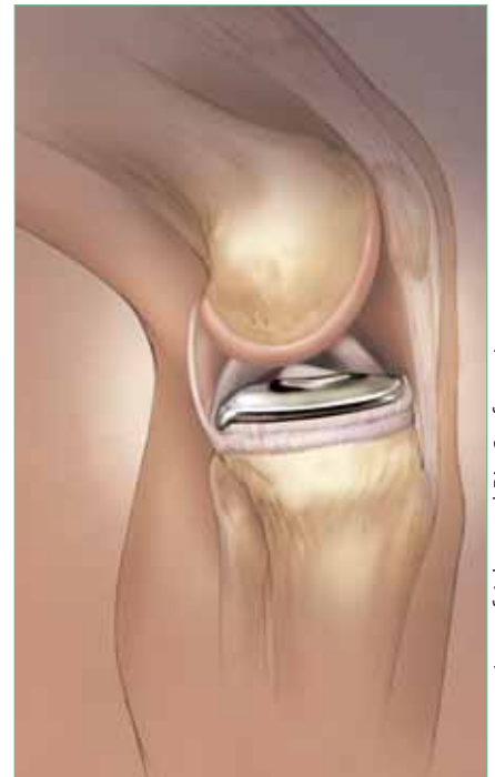
OrthoGlide™ Medial Knee Implant.

The Canadian cost for the OrthoGlide device is unavailable, but the US price is US$4,500. According to the manufacturer, 220 patients have received OrthoGlide implants, although the implant has not been used in any Canadian patients to date.