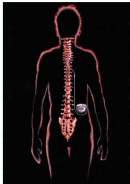
The spinal cord stimulator consists of an epidural lead, an extension wire, and a pulse generator.

The UK National Institute for Health and Clinical Excellence (NICE) is currently assessing spinal cord stimulation for chronic neuropathic or ischemic pain, with publication expected in November 2008.