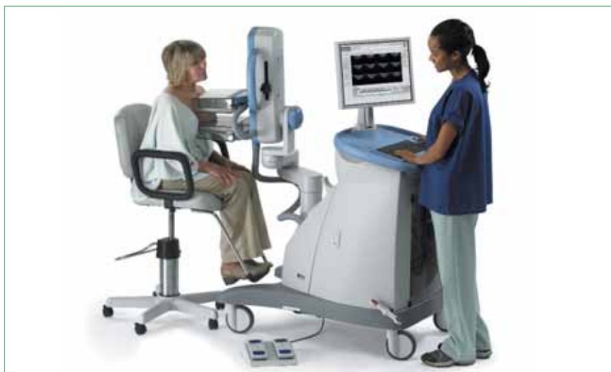
The Naviscan PEM Flex™ Solo II images the breast at the molecular level.