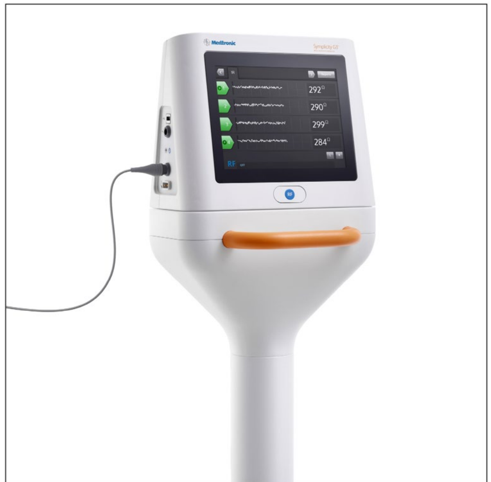
Figure 2: Simplicity G3 Generator That Delivers Radiofrequency Pulses to the Treatment Location